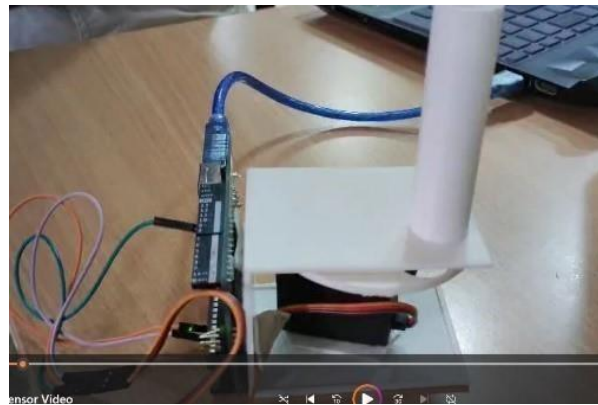
Fig. 2. Assembly of Pill dispensing unit